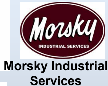
Morsky Industrial Services